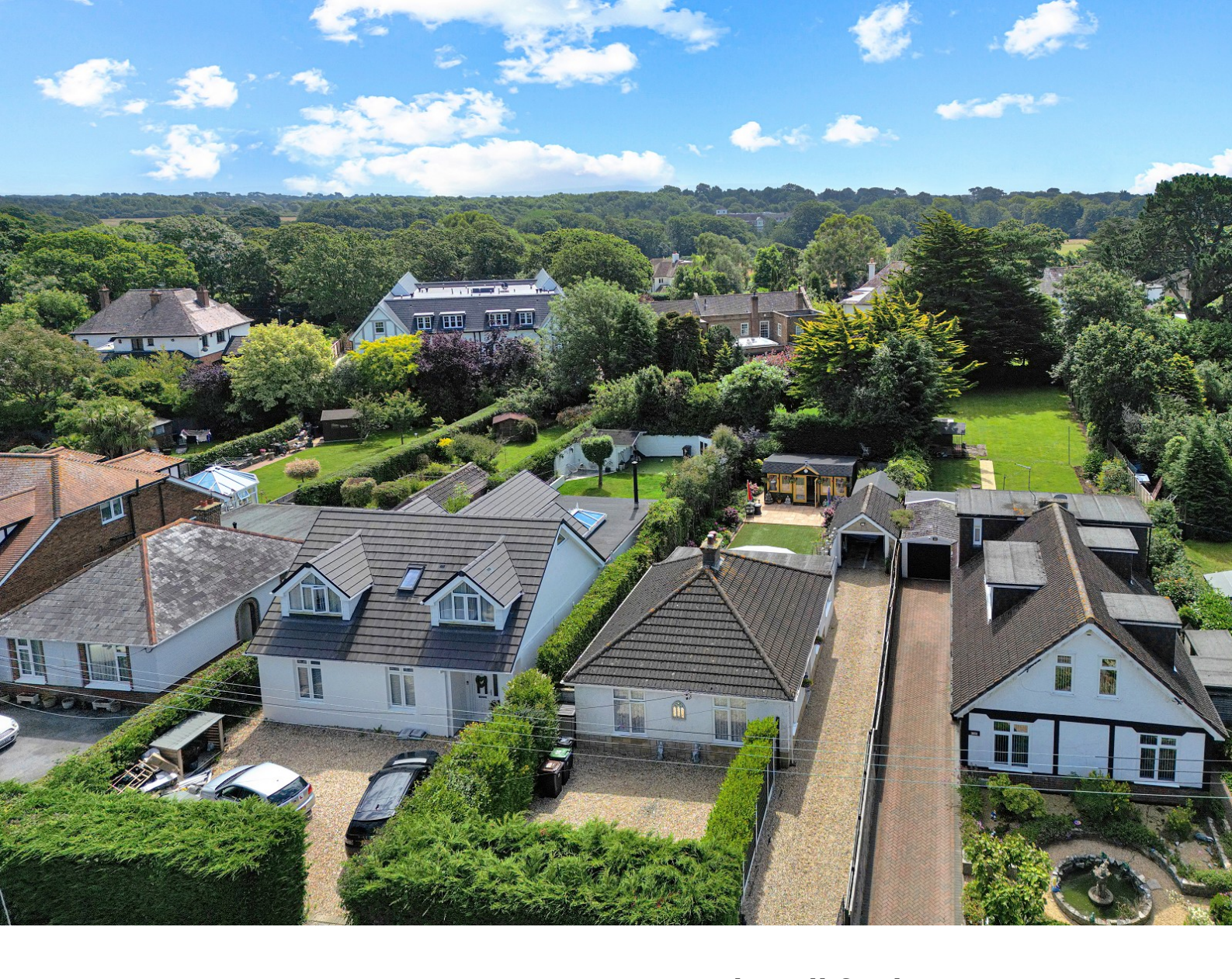
16 Avenue Road, Walkford, Dorset. BH23 5QH