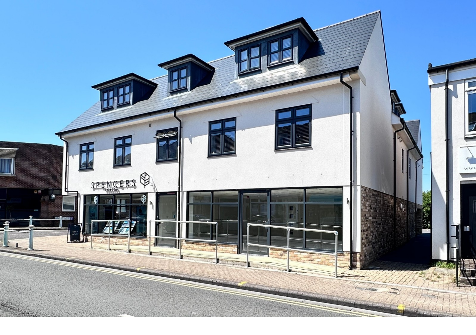
Unit 2, 370 Lymington Road, Highcliffe, Dorset. BH23 5EZ