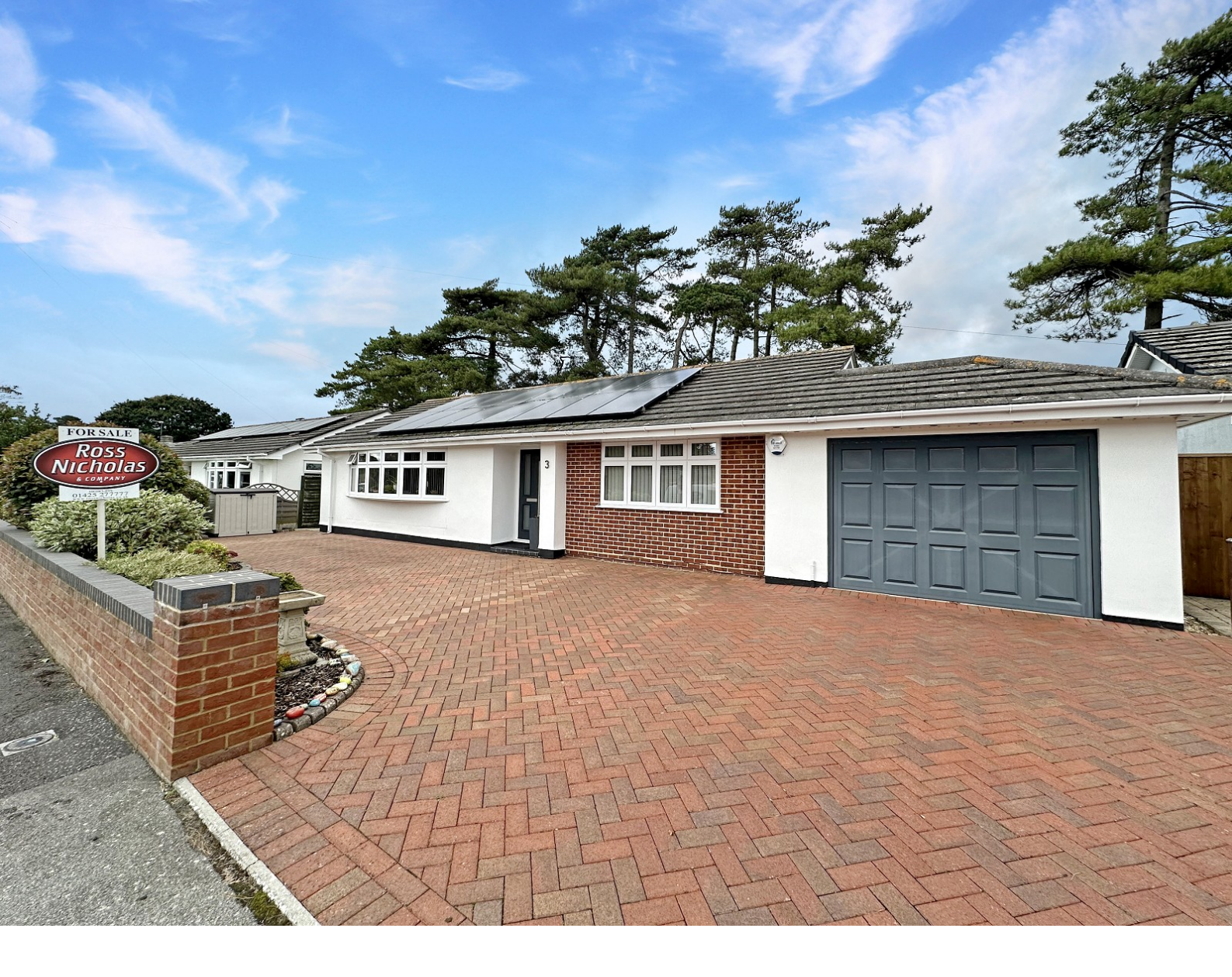
3 Elmwood Way, Highcliffe, Dorset. BH23 5DL Offers In Excess Of £750,000