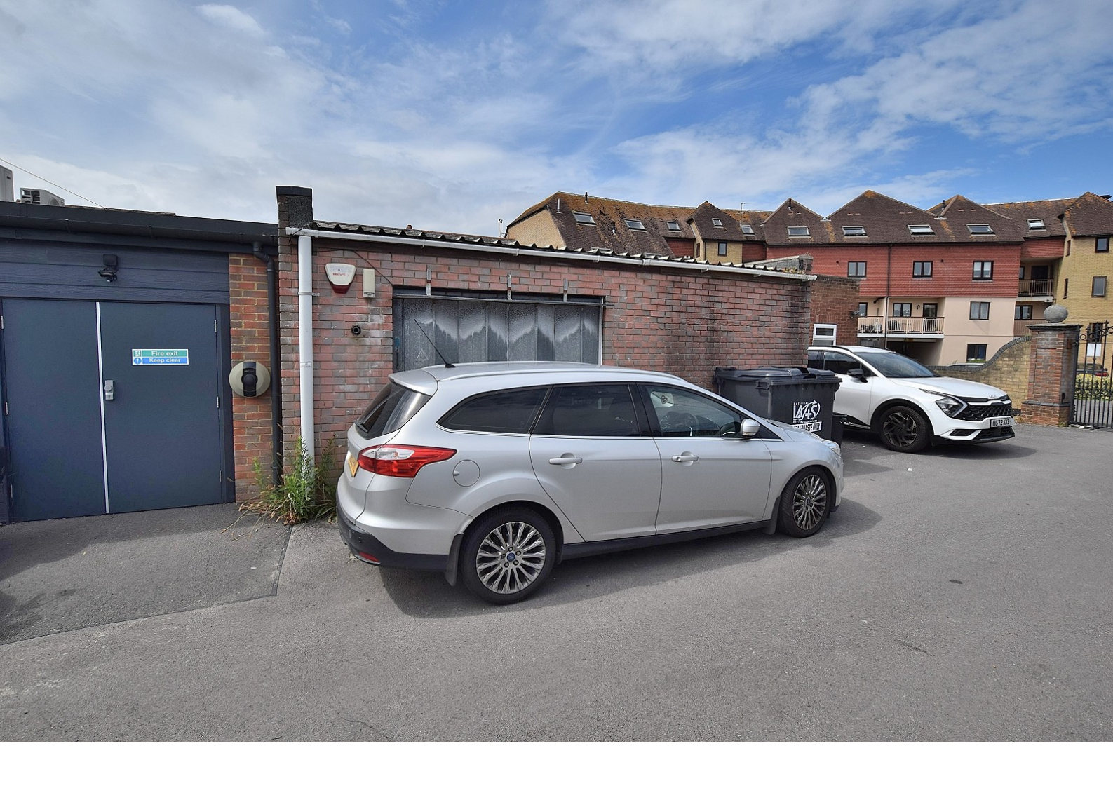
Rear of 47 Old Milton Road, New Milton, Hampshire. BH25 6DJ £750 Monthly