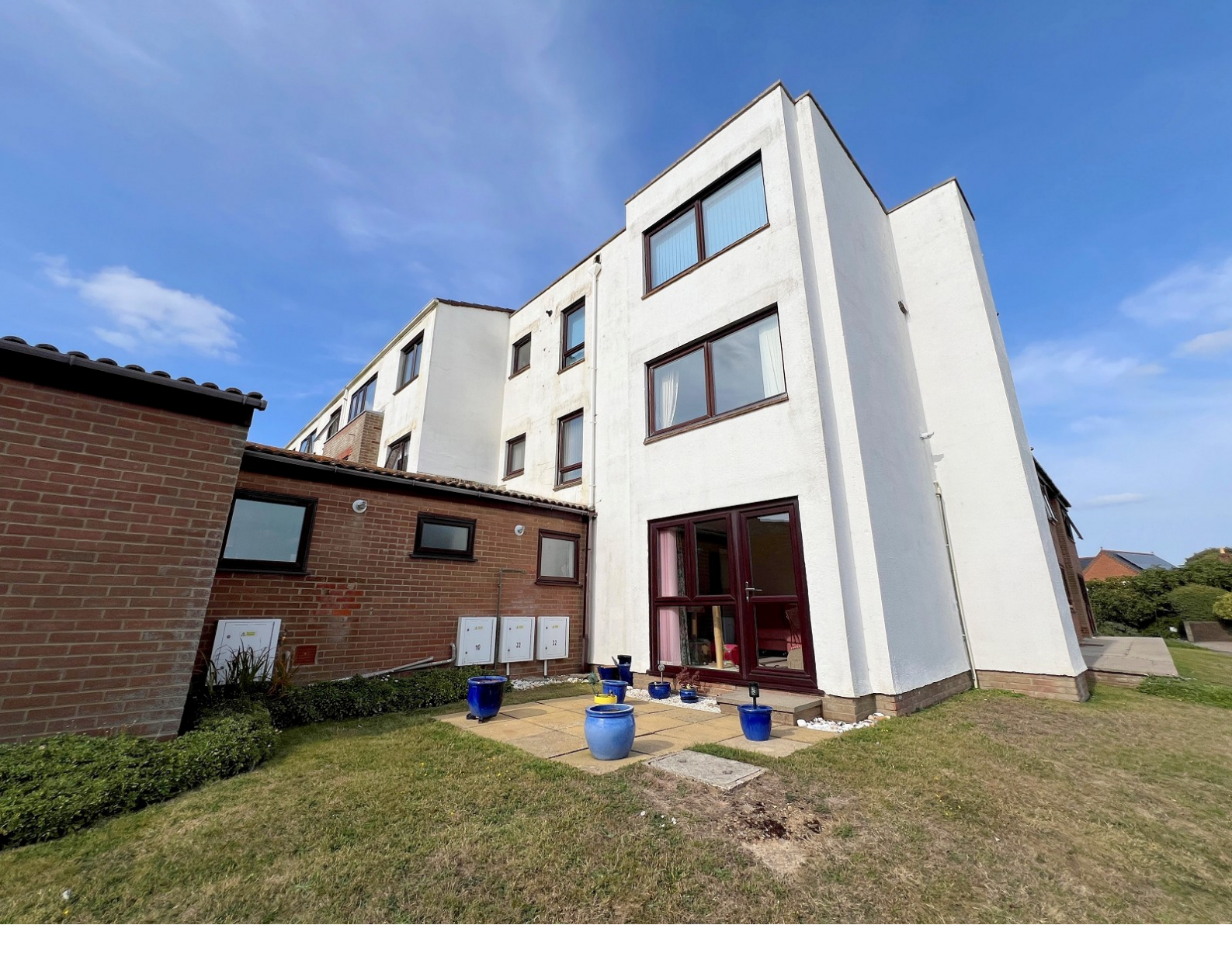
Flat 22 Homegrange Shingle Bank Drive, Milford On Sea. SO41 0WR