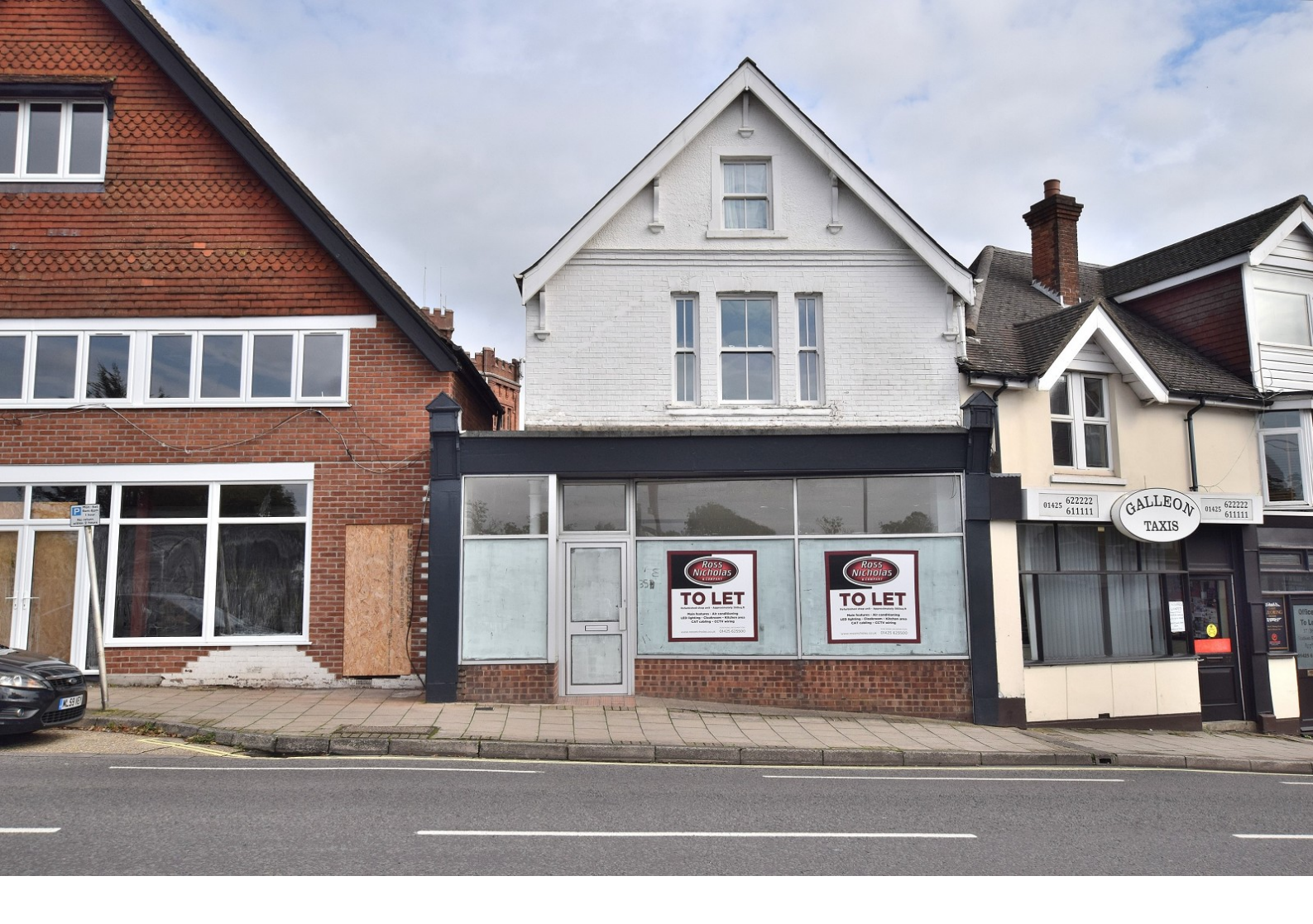
35 Station Road, New Milton, Hampshire. BH25 6HR